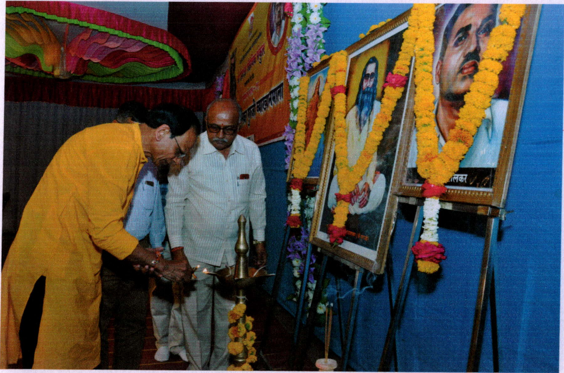
Shri Anilji Bokil inaugurating the Vyakhyanamala 2018-19 and expressing his thoughts on Economic revolution for enriching life style